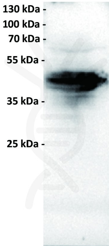
Figure 1. Anti-FOLR1 antibody (SKU# DMC100585) at 1/1000 dilution

Lane : HeLa (human cervical adenocarcinoma epithelial cell), whole cell lysate