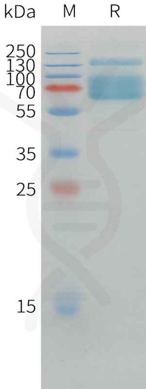
Figure 1. Canine PD-L1 Protein, hFc Tag on SDS-PAGE under reducing condition.