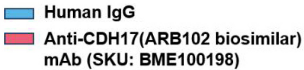
Figure 1. Flow cytometry analysis of human CDH17 overexpression using Hu_CDH17 K562 Cell Line (Cat. No. CEL100009) and Anti-CDH17(ARB102 biosimilar) mAb (Cat. No. BME100198)