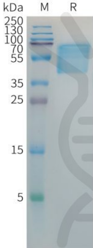
Figure 1. Hepatitis B virus HBSAG Protein, hFc Tag on SDS-PAGE under reducing condition.