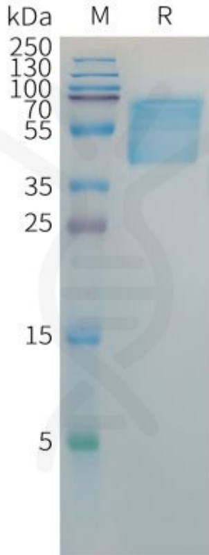
Figure 1. Hepatitis B virus HBSAG Protein, hFc Tag on SDS-PAGE under reducing condition.