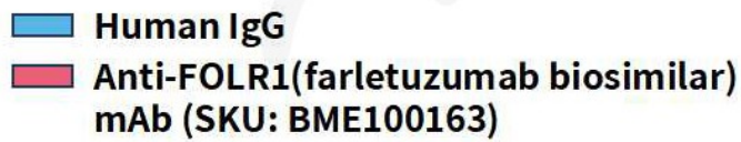
Figure 1. Flow cytometry analysis of human FOLR1 overexpression using Hu_FOLR1 293T Cell Line (Cat. No. CEL100024) and Anti-FOLR1(farletuzumab biosimilar) mAb (Cat. No. BME100163)