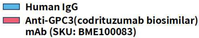
Figure 1. Flow cytometry analysis of human GPC3 overexpression using Hu_GPC3 K562 Cell Line (Cat. No. CEL100084) and Anti-GPC3(codrituzumab biosimilar) mAb (Cat. No. BME100083)