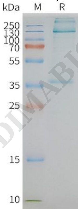
Figure2. Human ADGRE1-Nanodisc, Flag Tag on SDS-PAGE