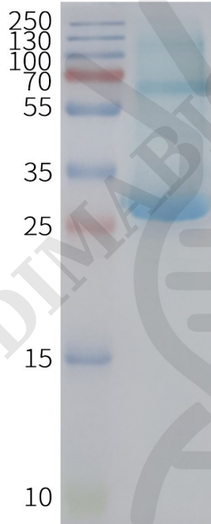
Figure2. Human ADGRE5-Nanodisc, Flag Tag on SDS-PAGE