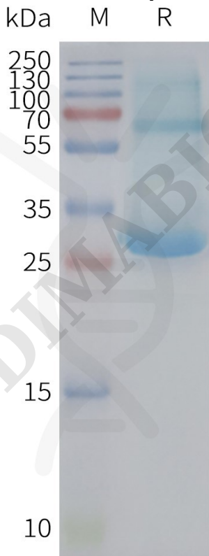
Figure2. Human ADGRE5-Nanodisc, Flag Tag on SDS-PAGE