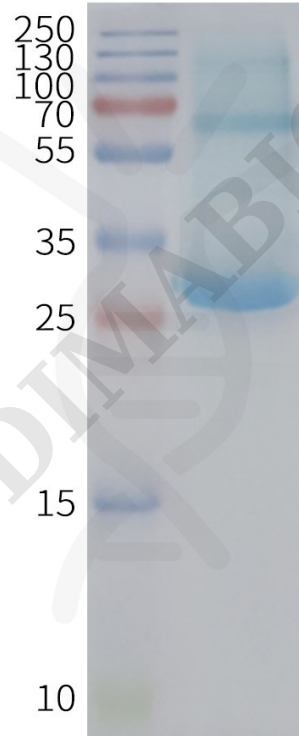
Figure2. Human ADGRE5-Nanodisc, Flag Tag on SDS-PAGE