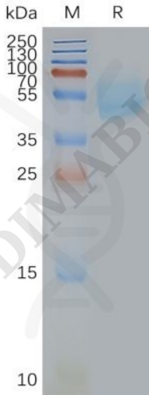
Figure2. Human ADORA2A-Nanodisc, Flag Tag on SDS-PAGE