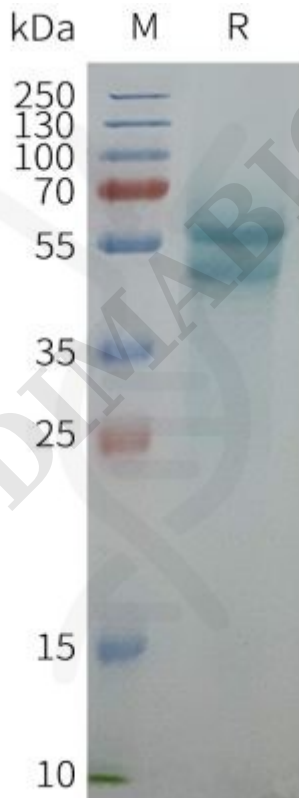
Figure2. Human ADRB1-Nanodisc, Flag Tag on SDS-PAGE