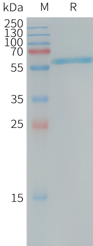
Figure 1. Human ALPP Protein, His Tag on SDS-PAGE under reducing condition.