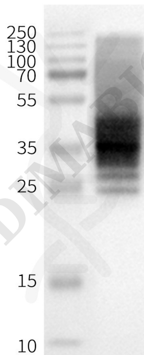
Figure 2. WB analysis of Human BDKRB2-Nanodisc with anti-Flag monoclonal antibody at 1/5000 dilution, followed by Goat Anti-Rabbit IgG HRP at 1/5000 dilution