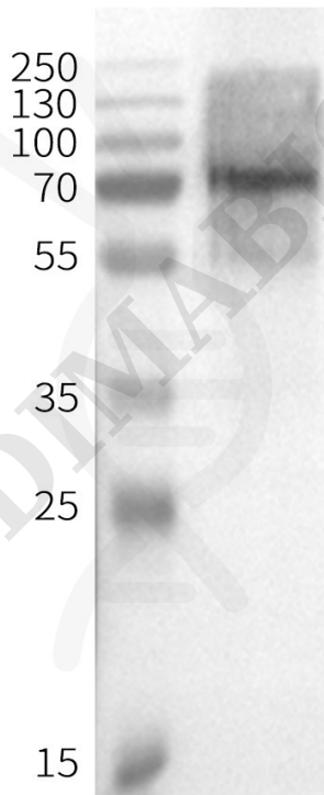
Figure 2. WB analysis of BRIL-GPR75-Nanodisc with anti-GPR75 monoclonal antibody (DMC100368), followed by Goat Anti-Human IgG HRP at 1/5000 dilution