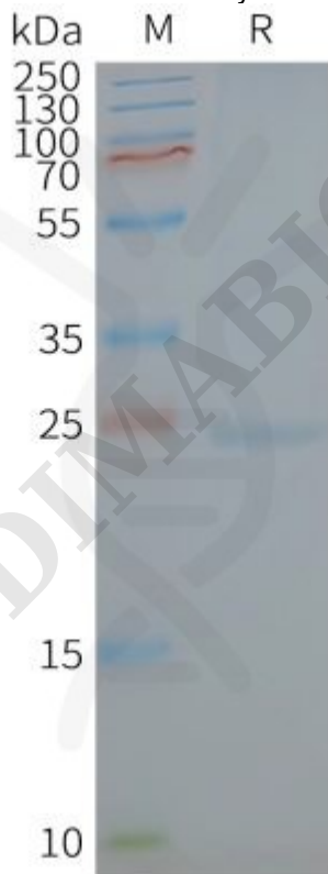
Figure2. Human CAV1-Nanodisc, Flag Tag on SDS-PAGE