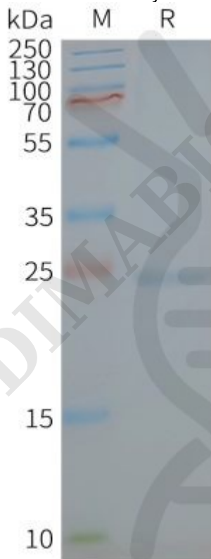
Figure2. Human CAV1-Nanodisc, Flag Tag on SDS-PAGE