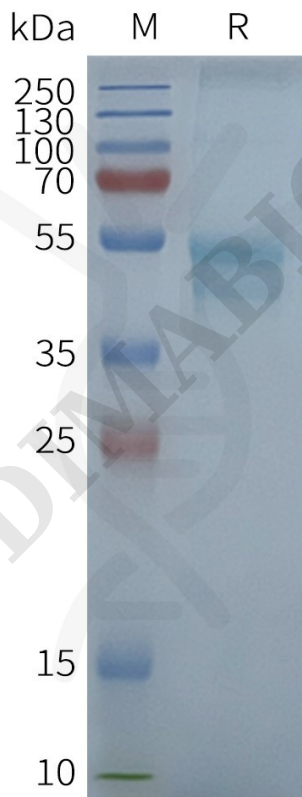
Figure 2. Human CCR1-Nanodisc, Flag Tag on SDS-PAGE