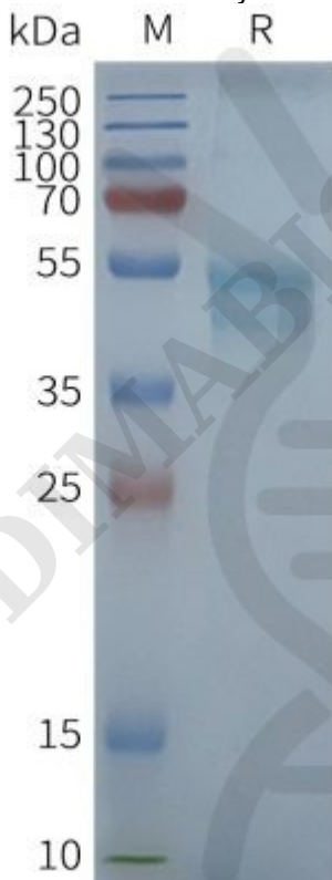
Figure2. Human CCR1-Nanodisc, Flag Tag on SDS-PAGE