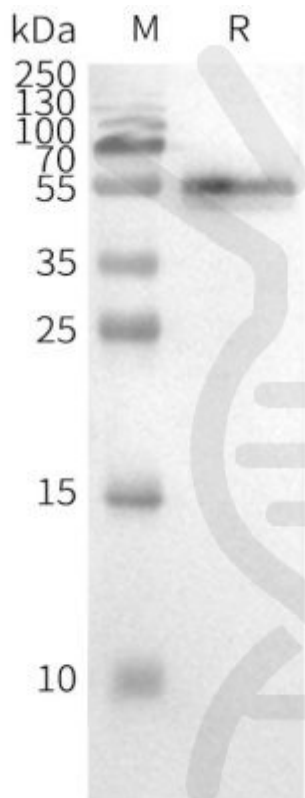
Figure3. WB analysis of Human CCR2-Nanodisc with anti-CCR2 monoclonal antibody (BME100087), followed by Goat Anti-Human IgG HRP at 1/5000 dilution