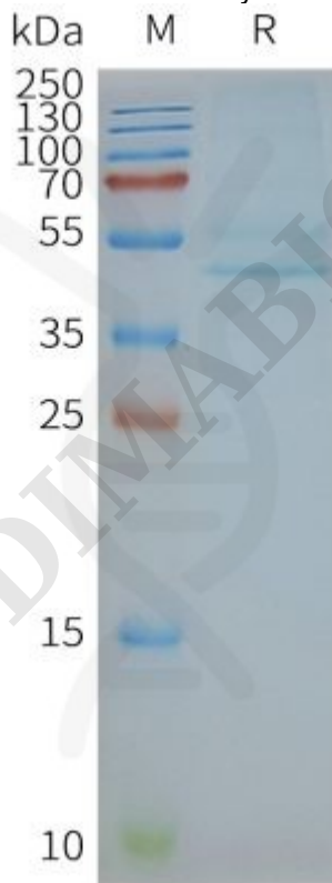
Figure2. Human CCR3-Nanodisc, Flag Tag on SDS-PAGE