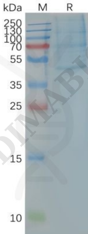
Figure2. Human CCR4-Nanodisc, Flag Tag on SDS-PAGE