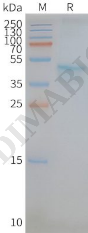
Figure2. Human CCR5-Nanodisc, Flag Tag on SDS-PAGE