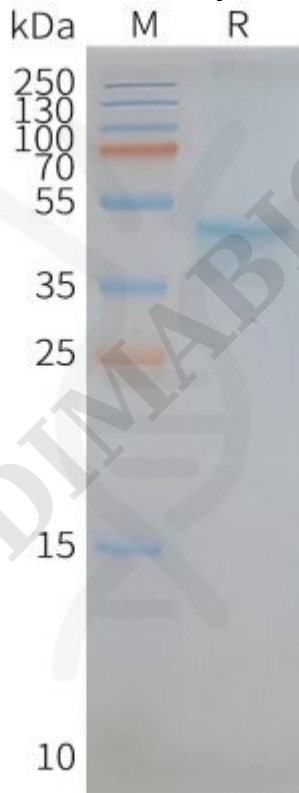
Figure2. Human CCR5-Nanodisc, Flag Tag on SDS-PAGE