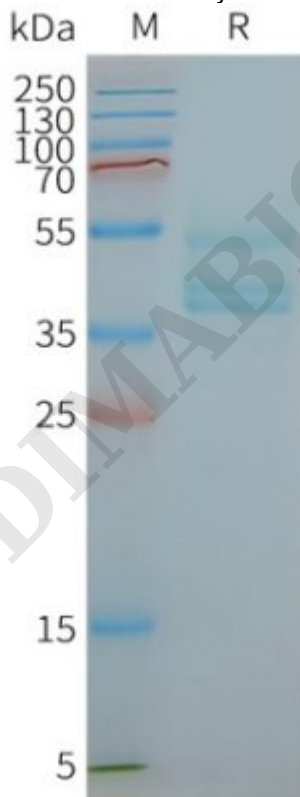
Figure2. Human CCR6-Nanodisc, Flag Tag on SDS-PAGE