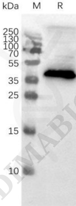
Figure 2. Western blot of CCR8 MNPs

D. CCR8 full length membrane nanoparticles samples were stained with anti-CCR8 antibody (BME100063) at 2 \mu\text{g}/\text{mL} , followed by Goat anti-human IgG 488 secondary antibody.