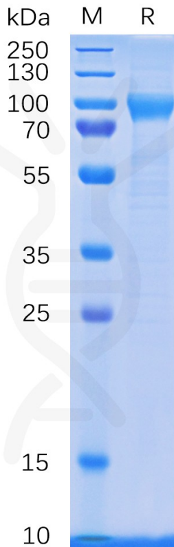
Figure 1. Human CD114 Protein, His Tag on SDS-PAGE under reducing condition.