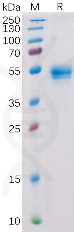
Figure 1. Human CD160 Protein, hFc Tag on SDS-PAGE under reducing condition.