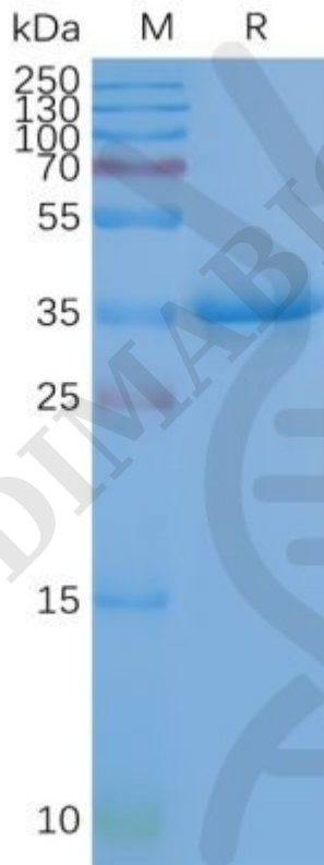
Figure2. Human CD20-Nanodisc, Flag Tag on SDS-PAGE