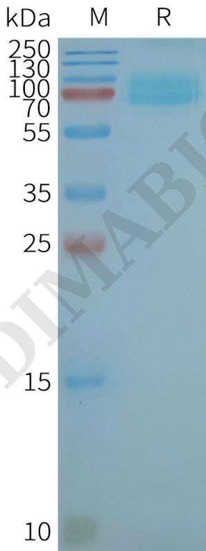
Figure 2. Human CD36-Nanodisc, Flag Tag on SDS-PAGE