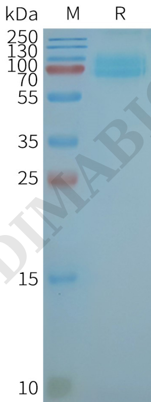
Figure 2. Human CD36-Nanodisc, Flag Tag on SDS-PAGE