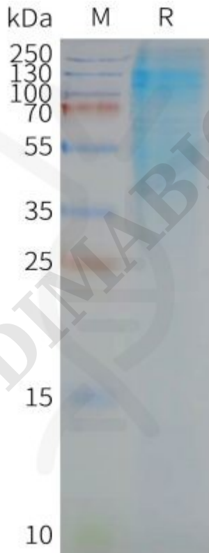
Figure2. Human CD37-Nanodisc, Flag Tag on SDS-PAGE