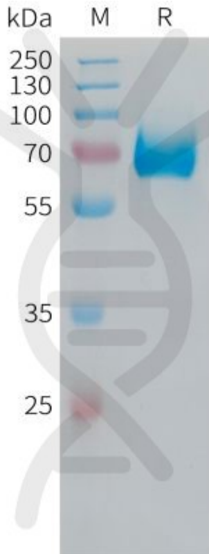
Figure 1. Human CD38, hFc Tag on SDS-PAGE under reducing condition.