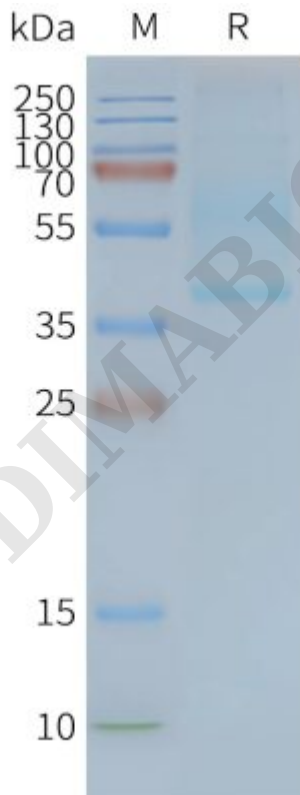
Figure2. Human CD47-Nanodisc, Flag Tag on SDS-PAGE