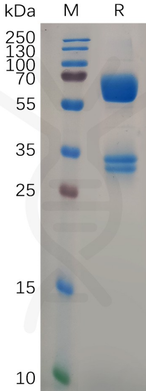
Figure 1. Human CD74(73-296) Protein, hFc Tag on SDS-PAGE under reducing condition.