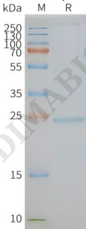
Figure2. Human CD81-Nanodisc, Flag Tag on SDS-PAGE