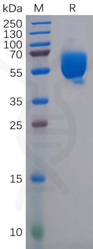
Figure 1. Human CD83 Protein, hFc Tag on SDS-PAGE under reducing condition.