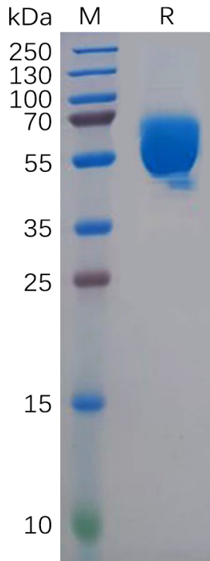
Figure 1. Human CD83 Protein, hFc Tag on SDS-PAGE under reducing condition.