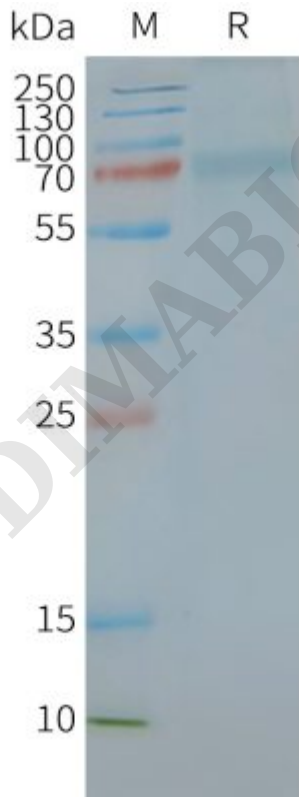
Figure2. Human CGRPR-RAMP1-Nanodisc, Flag Tag on SDS-PAGE