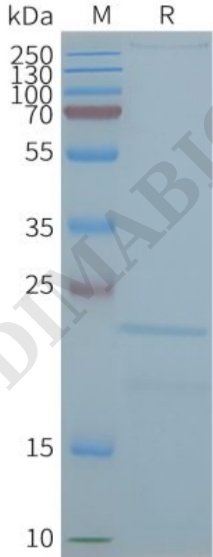
Figure2. Human CLDN2-Nanodisc, Flag Tag on SDS-PAGE