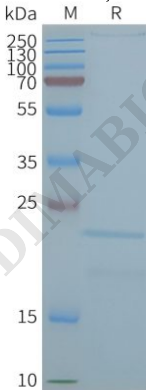
Figure2. Human CLDN2-Nanodisc, Flag Tag on SDS-PAGE