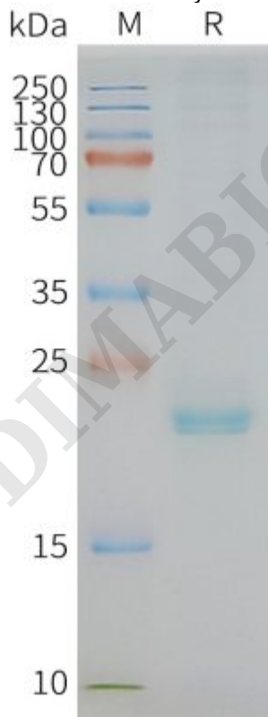
Figure2. Human CLDN3-Nanodisc, Flag Tag on SDS-PAGE