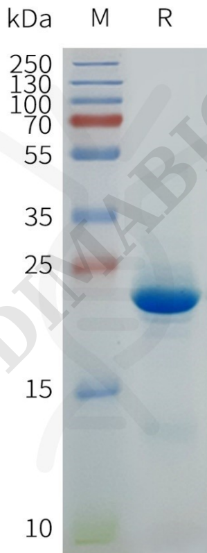
Figure 2. Human CLDN6-Strep-Nanodisc, C-Flag&Strep Tag on SDS-PAGE