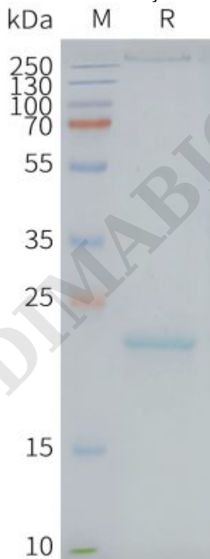
Figure2. Human CLDN9-Nanodisc, Flag Tag on SDS-PAGE