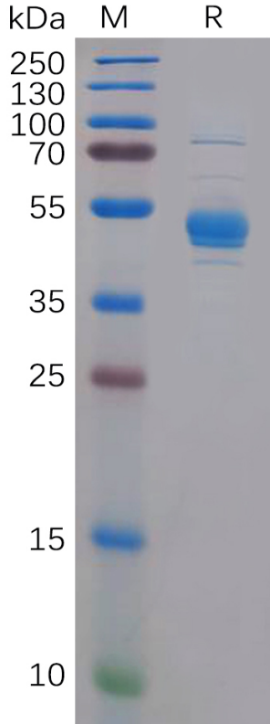
Figure 1. Human CLEC2D Protein, hFc Tag on SDS-PAGE under reducing condition.