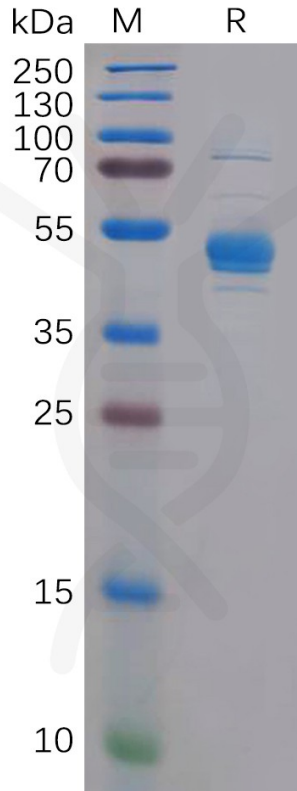
Figure 1. Human CLEC2D Protein, hFc Tag on SDS-PAGE under reducing condition.