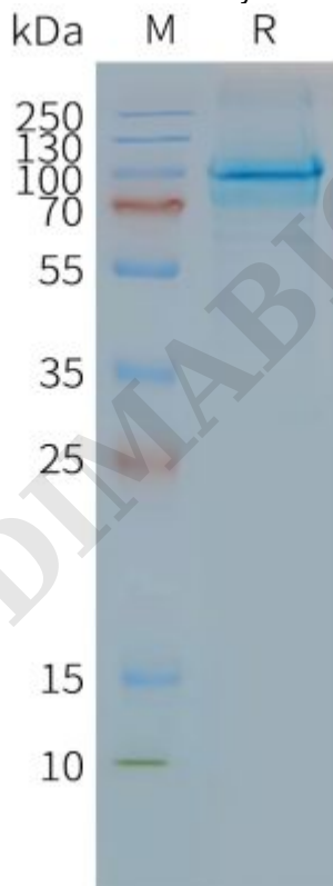
Figure2. Human CLPTM1-Nanodisc, Flag Tag on SDS-PAGE