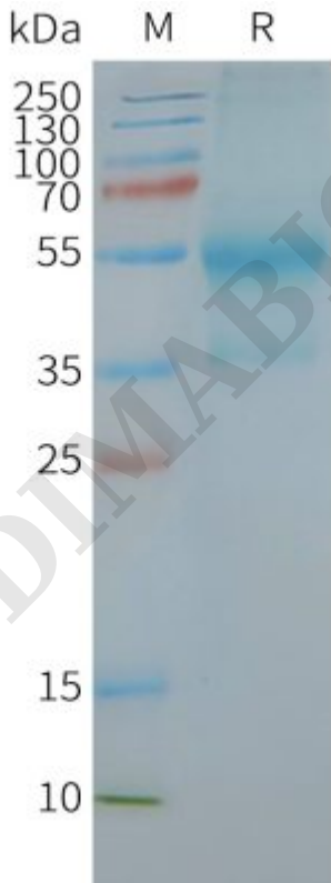
Figure2. Human CXCR4-Nanodisc, Flag Tag on SDS-PAGE