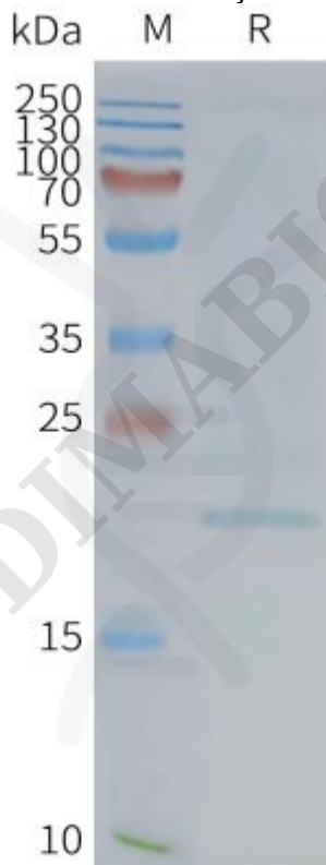
Figure2. Human EMP2-Nanodisc, Flag Tag on SDS-PAGE