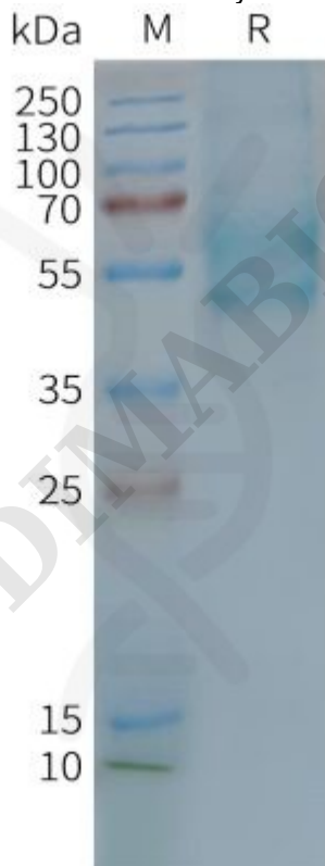
Figure2. Human F2RL3-Nanodisc, Flag Tag on SDS-PAGE