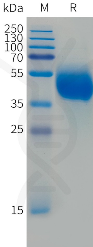
Figure 1. Human FCRL5(745-847) Protein, hFc Tag on SDS-PAGE under reducing condition.