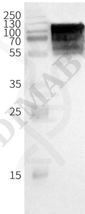
Figure2. WB analysis of Human GPR75-Nanodisc with anti-Flag monoclonal antibody at 1/5000 dilution, followed by Goat Anti-Rabbit IgG HRP at 1/5000 dilution