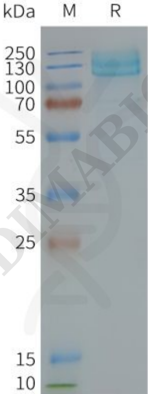
Figure2. Human GRM7-Nanodisc, Flag Tag on SDS-PAGE