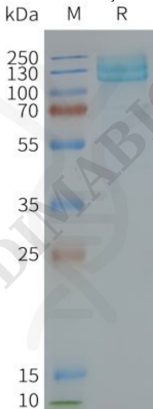
Figure2. Human GRM7-Nanodisc, Flag Tag on SDS-PAGE