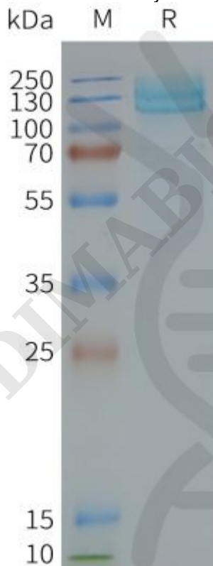
Figure2. Human GRM7-Nanodisc, Flag Tag on SDS-PAGE