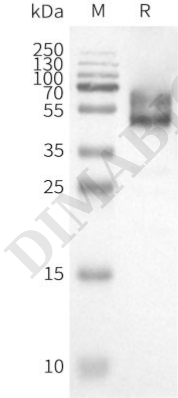
Figure2. WB analysis of Human HCRTR1-Nanodisc with anti-Flag monoclonal antibody at 1/5000 dilution, followed by Goat Anti-Rabbit IgG HRP at 1/5000 dilution