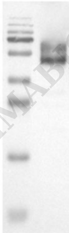
Figure2. WB analysis of Human HCRTR1-Nanodisc with anti-Flag monoclonal antibody at 1/5000 dilution, followed by Goat Anti-Rabbit IgG HRP at 1/5000 dilution