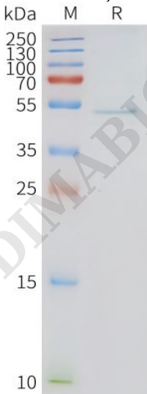
Figure2. Human HRH3-Nanodisc, Flag Tag on SDS-PAGE