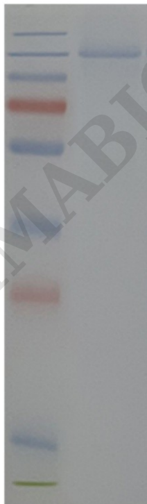
Figure 2. Human KCNH2-Strep-Nanodisc, C-Flag&Strep Tag on SDS-PAGE