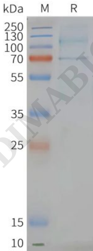
Figure2. Human LGR6-Nanodisc, Flag Tag on SDS-PAGE