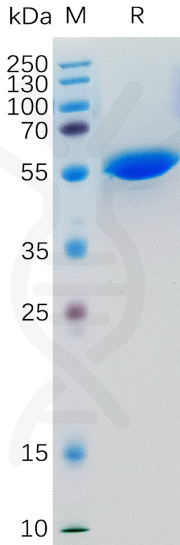
Figure 1. Human LIGHT Protein, hFc Tag on SDS-PAGE under reducing condition.