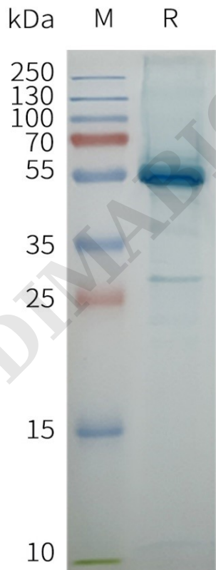
Figure 2. Human MBP-CLDN6-Nanodisc with N-MBP Tag, C-Flag Tag on SDS-PAGE